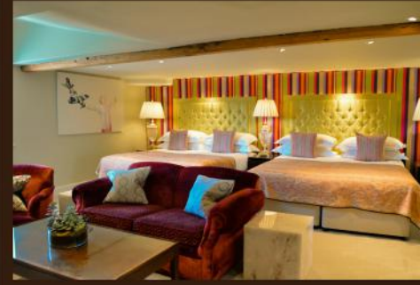
Two-Bed Loft Room