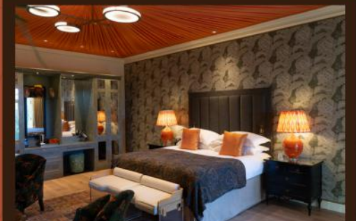
Luxury Hot Tub Suite