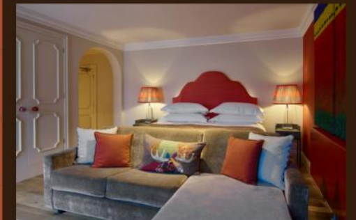
Hot Tub Junior Suite